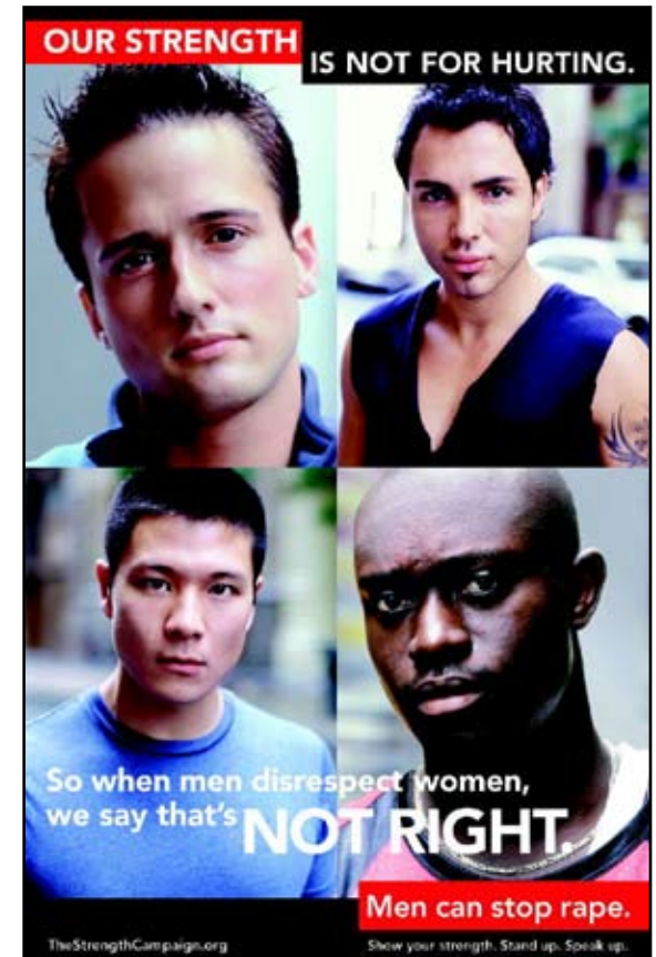
Advertisement courtesy of the Strength Mediaworks Campaign, http://www.mencanstoprape.org/

In order to address the socialization of young men that leads to the reproduction and perpetuation of gender inequity, MCSR launched a Strength Campaign. In 2000 it developed the Men of Strength (MOST) Club to urge high school boys to redefine masculinity in a way that will promote safe and healthy relationships and ultimately reduce instances of sexual violence. The National Crime Prevention Council profiled MOST Club "as one of the nation's most promising '50 Strategies to Prevent Violent Domestic Crimes,'" 3 and in 2003, MOST Club was selected as one of the top four gender violence prevention programs by